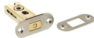
Product Finish Pictured: Satin Nickel (SN)